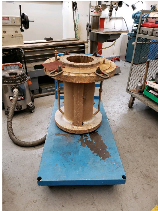
Lower guide bearing

John Day operations immediately started South fish turbine pump #1 and returned the ladder within FPP criteria. Fish turbine pump #2 will have to be dewatered and inspected to assess the severity of the problem and plan a scope of work to fix the issue. At that time an estimated return to service date can be determined.